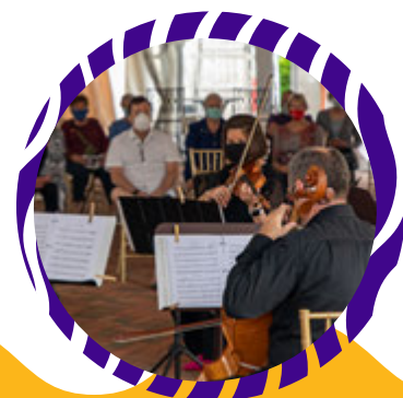
Cincinnati Chamber Orchestra performs at the Taft Museum of Art

† Has supported the ArtsWave Campaign consecutively for 15 years or more.