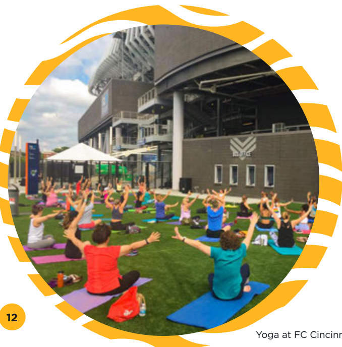
Yoga at FC Cincinnati's TQL Stadium