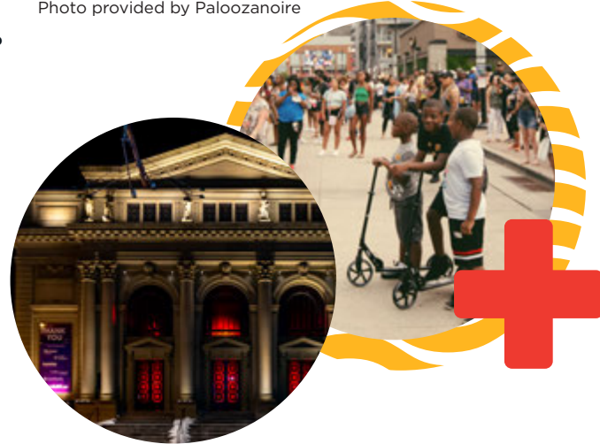
Memorial Hall during #ILoveTheArts, the 2021 ArtsWave Campaign kickoff

A crowd celebrates at Paloozanoire's "In the Streets on Juneteenth" block party