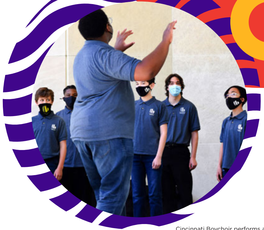
Cincinnati Boychoir performs at the Seasongood Pavilion in Eden Park

Cincinnati Arts Association Cincinnati Museum Center Cincinnati Public Radio Cincy Nice CMF Outdoor Museum Friends of Music Hall Gallery at Gumbo Greater Cincinnati Native American Coalition King Legacy Celebration (National Underground Railroad Freedom Center) Paloozanoi's Juneteenth Block Party PhotographERS A Womens' Collective Robert O'Neal Multicultural Art Center The SCPA Fund The Street Stage Project