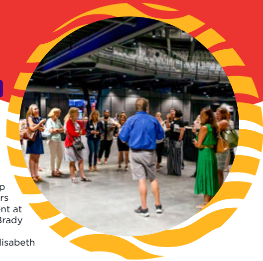
Women's Leadership Roundtable members attend a special event at the new Andrew J Brady ICON Music Center