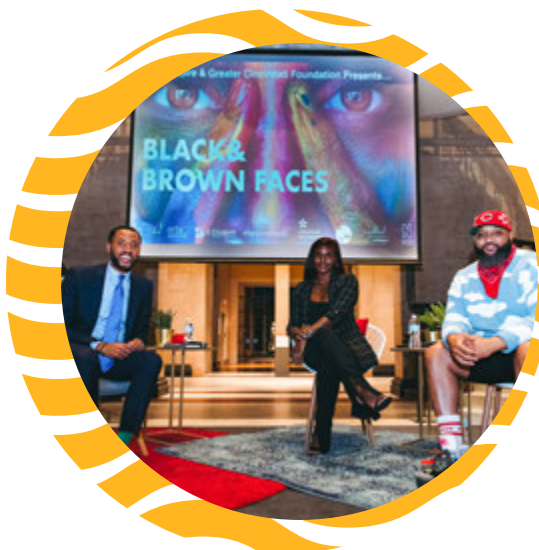
A panel discussion at the "Black & Brown Faces" exhibition at Cincinnati Art Museum