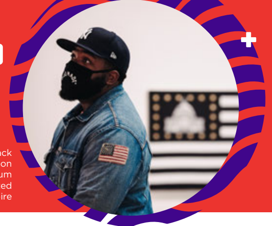
Visitors explore the "Black & Brown Faces" exhibition at Cincinnati Art Museum