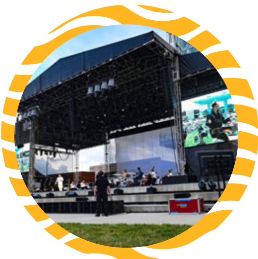
Cincinnati Opera kicks off their 101st season with Opera in the Park