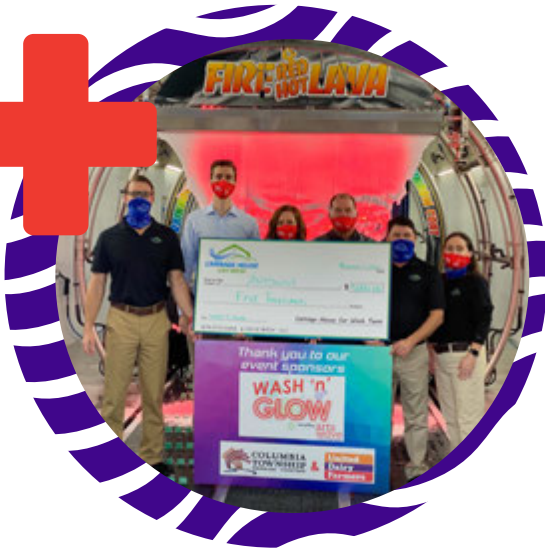
Carriage House Car Wash presenting proceeds to ArtsWave from their Wash 'n' Glow fundraiser