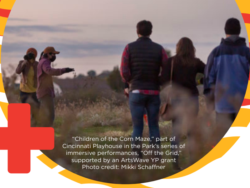
"Children of the Corn Maze," part of Cincinnati Playhouse in the Park's series of immersive performances, "Off the Grid," supported by an ArtsWave YP grant