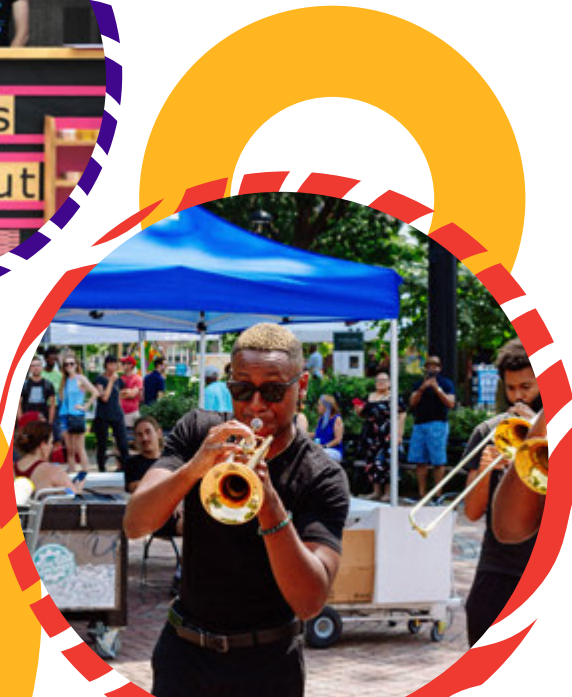
Black Brass performs at the CMF Outdoor Museum in Washington Park