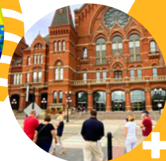
A group of ArtsWave donors take an outdoor tour of Music Hall as part of 2020's modified Music Hall for Two benefit