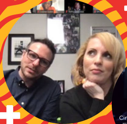
Drew and Lea Lachey join "Artful Mindfulness and the Enneagram," the first Arts4Wellness event