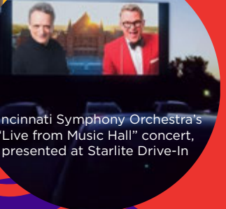
Cincinnati Symphony Orchestra's "Live from Music Hall" concert, presented at Starlite Drive-In