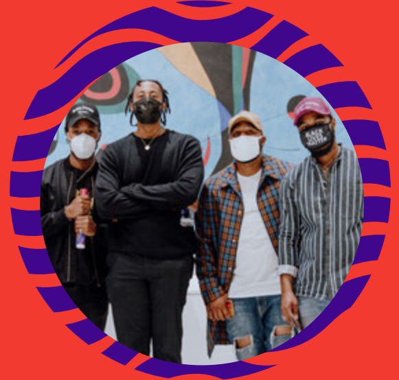
Artists at the opening of Cincinnati Art Museum's "Black & Brown Faces" exhibition