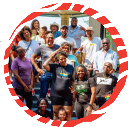
Artists and participants at the 2021 Cincinnati Music Festival Outdoor Museum, sponsored by P&G, ArtsWave, Kroger, 3CDC and AGAR

C-Forward, Inc. The Children's Home The Children's Theatre of Cincinnati Staff Cincinnati and Hamilton County Public Library Cincinnati Ballet Staff and Dancers Cincinnati Bengals Cincinnati Development Fund Staff Cincinnati Public Radio Staff Cincinnati State Technical and Community College Faculty & Staff Cincinnati USA Convention and Visitors Bureau Cincinnati Works CLH Foundation Contemporary Arts Center Staff