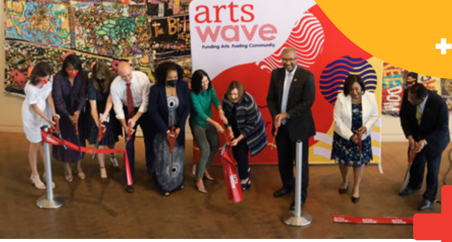
The ribbon cutting for the Truth and Reconciliation Artist Showcase at the National Underground Railroad Freedom Center