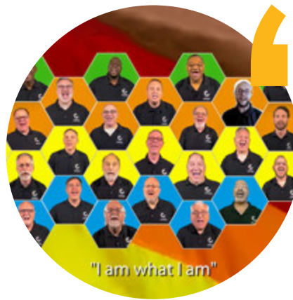
Cincinnati Men's Chorus performs in "Big Gay Broadway," their 2021 Pride concert

Without the opportunity to do in-person concerts... the grant that we received from ArtsWave Pride has gone a long way toward us being able to replace that missing earned income.