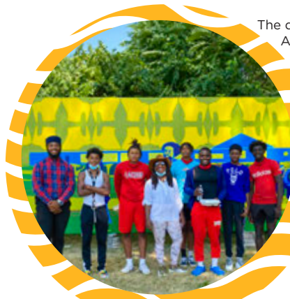
The dedication ceremony for the ArtWorks mural "Black Excellence in Zone 15," the first public art project in historic Lincoln Heights