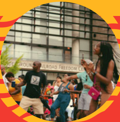
A crowd celebrates at Paloozanoire's annual In the Streets on Juneteenth block party