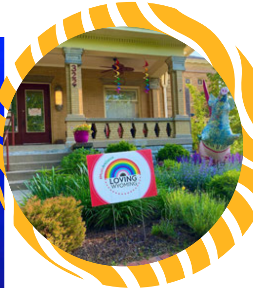
The Wyoming Fine Arts Center's Loving Wyoming initiative, a series of free classes and visual art exhibition showcasing LGBTQIA+ Pride, received support from an ArtsWave Pride grant