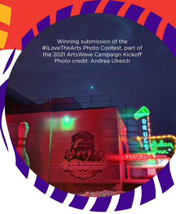
Winning submission of the #ILoveTheArts Photo Contest, part of the 2021 ArtsWave Campaign Kickoff