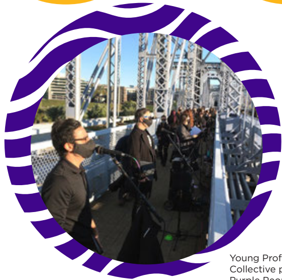
Young Professionals Choral Collective performs on the Purple People Bridge

Over the last year, more than 100 organizations received support to advance ArtsWave’s Blueprint for Collective Action and bolster their resilience despite continued disruption. In 2021, ArtsWave’s $11 million campaign invigorated our cultural landscape through these grant programs: