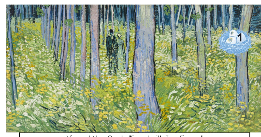
Vincent Van Gogh, "Forest with Two Figures" Corrected word: