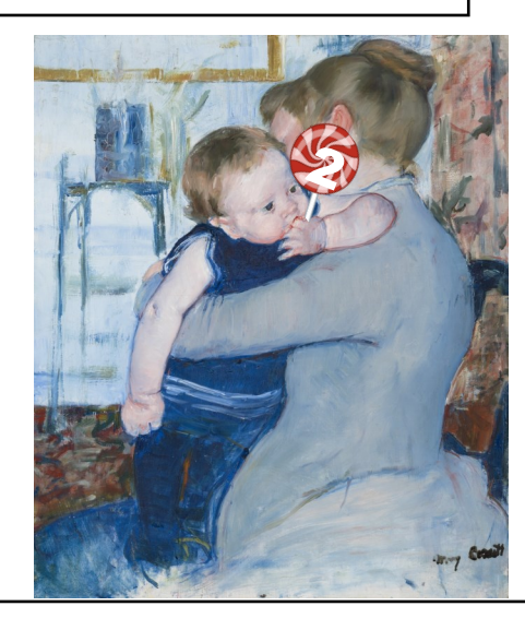
Mary Cassatt, "Toddler in Dark Blue Suit, Looking Over His Mother's Shoulder" Corrected word: