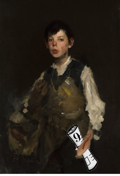
Frank Duveneck, "The Paper Boy" Corrected word: