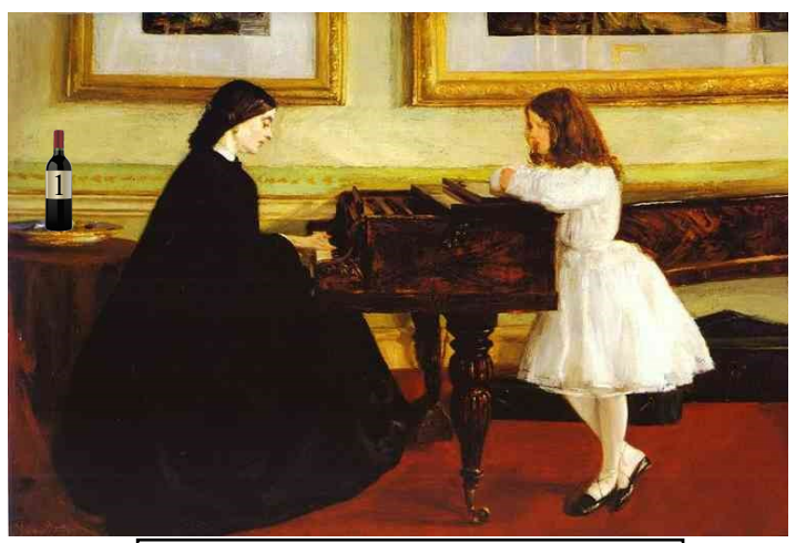
James McNeill Whistler, "Playin' the Piano" Corrected word: